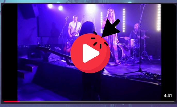
The Flow State - Highlights from EP Launch Gig at Independent Sunderland